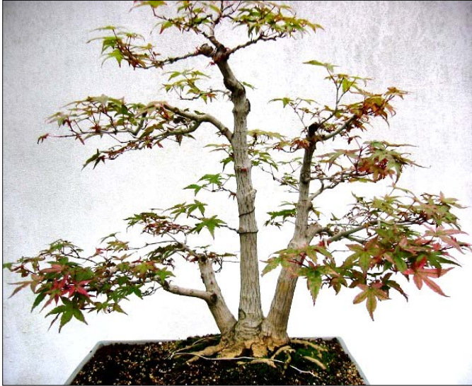
2004: tree after initial thinning out