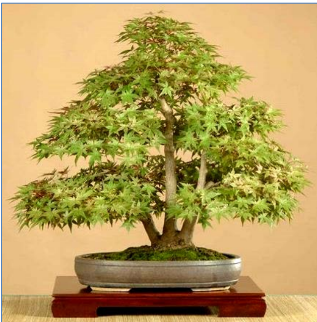
Tree as it appeared in 2010

Following its acquisition, it was placed in the Collection in full leaf. Once its' leaves had dropped, it was removed from the Collection and re-styled at her home by Kath Hughes. This necessitated the removal or shortening of a number of branches in order to establish a better image of the tree.