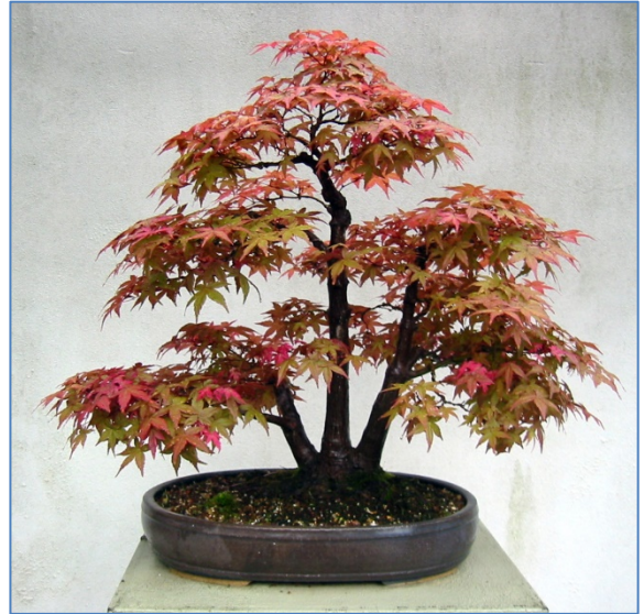
Appearance in 2007

Following its acquisition, it was placed in the Collection in full leaf. Once its' leaves had dropped, it was removed from the Collection and re-styled at her home by Kath Hughes. This necessitated the removal or shortening of a number of branches in order to establish a better image of the tree.