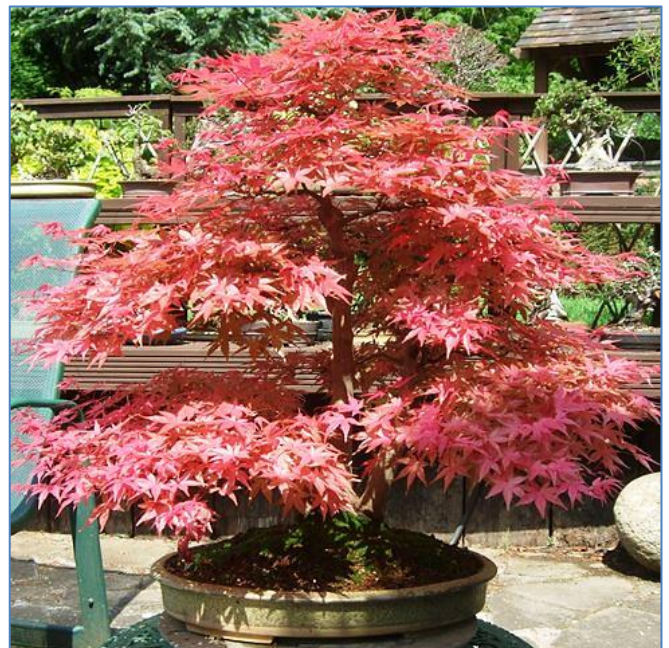
Spring of 2020 prior to thinning out

It was allowed to develop over a season before being restored to the Collection, where it has since proved a popular exhibit with the public, the seasonal variations in leaf colour being a highlight. As a deciduous specimen, it has required regular trimming two or three times a year during the growing season, but maintains a well- defined shape.